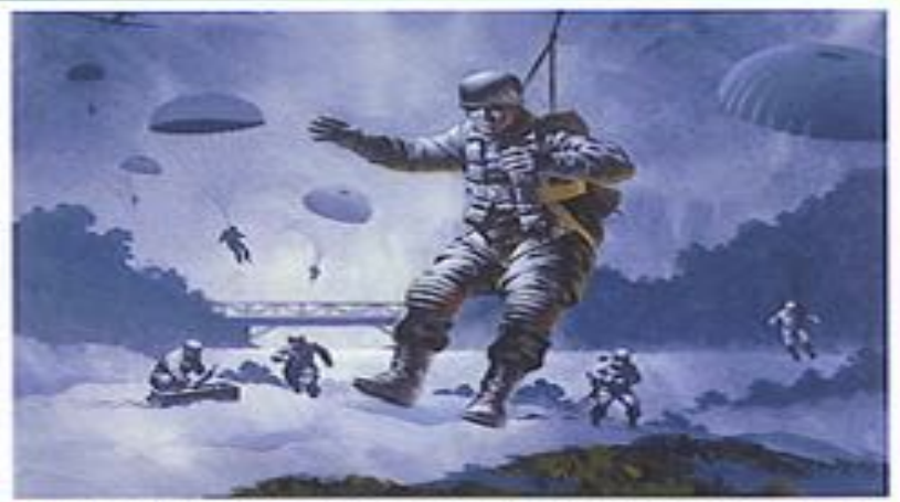
▲ 2. Paratroopers and gliders land behind the enemy front line and cause chaos, capturing important bridges and buildings.