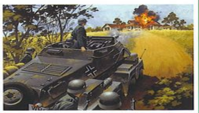
▲ 4. The enemy's front line finds itself cut off from its supports, and surrenders.