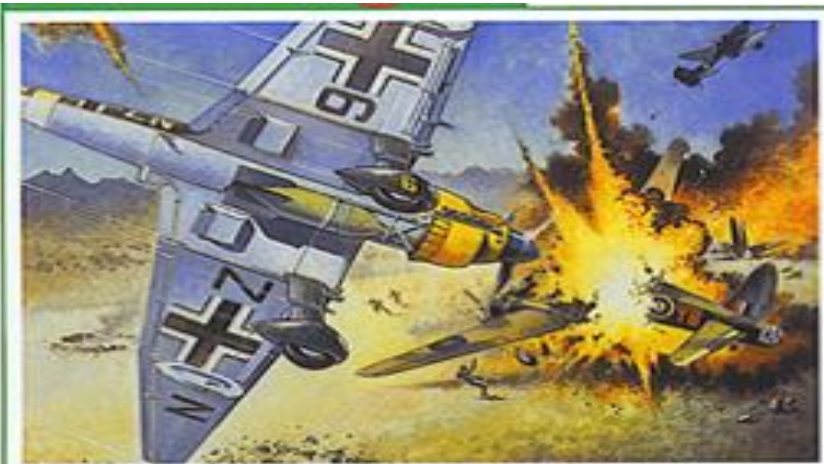
A 1. Airplanes bomb the troops, and all the army headquarters, bridges, roads and telephone exchanges behind the enemy front line.