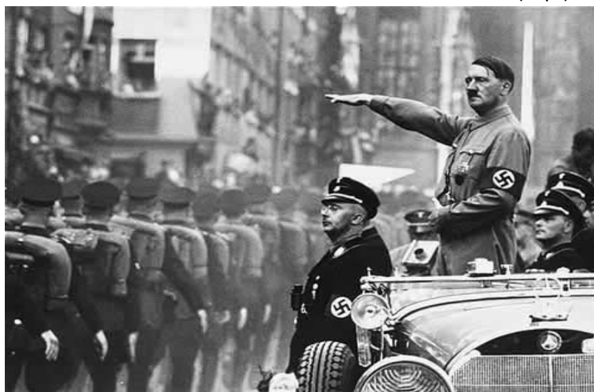
NAZI GERMANY 1933 Hitler

What problems were the Weimar government facing? And how did Hitler become Chancellor in 1933?